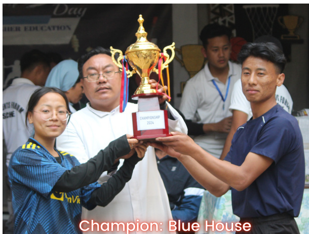
Champion: Blue House