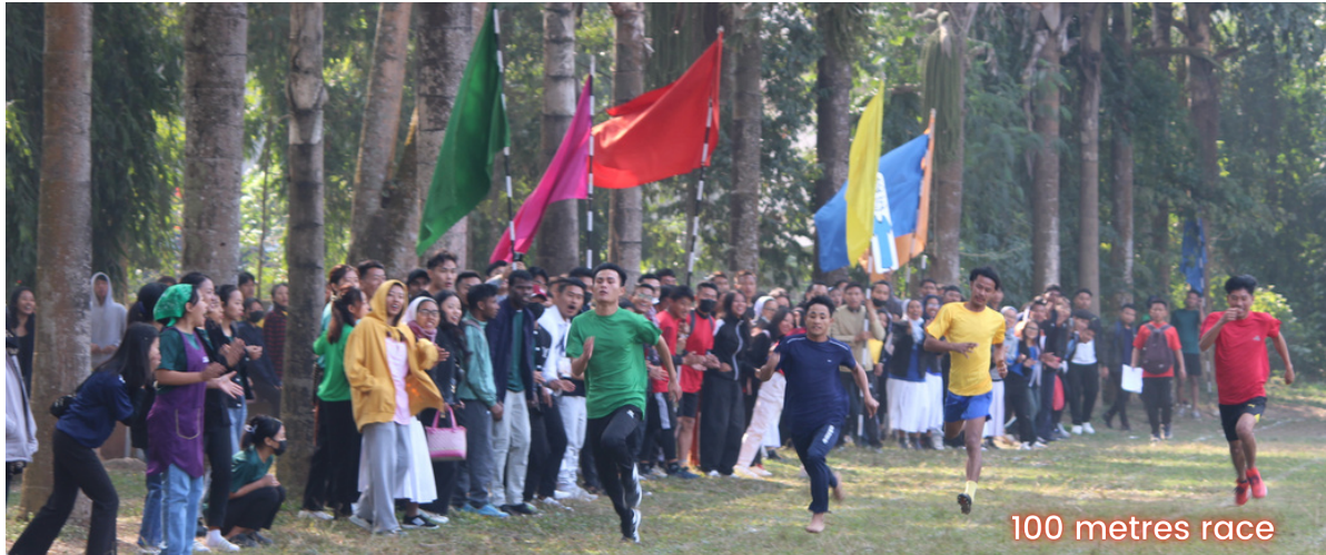
100 metres race