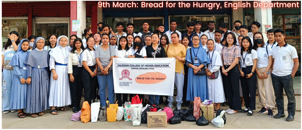
9th March: Bread for the Hungry, English Department