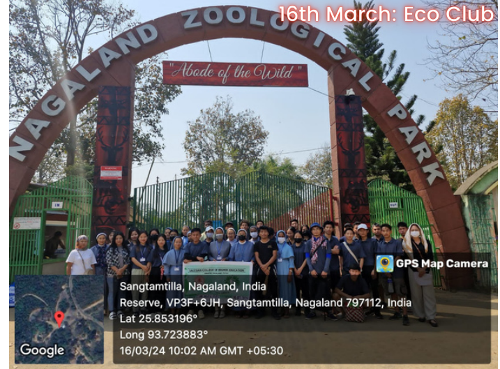
16th March: Eco Club

Dimapur, NL, India Half Nagarjan, Dimapur, 797112, NL, India Lat 25.883808, Long 93.726163 03/19/2024 10:09 GMT+05:30 Note : Captured by GPS Map Camera