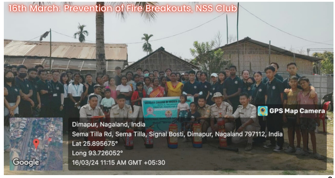
16th March: Prevention of Fire Breakouts, NSS Club

Dimapur, Nagaland, India Sema Tilla Rd, Sema Tilla, Signal Bosti, Dimapur, Nagaland 797112, India Lat 25.895675° Long 93.726052° 16/03/24 11:15 AM GMT +05:30