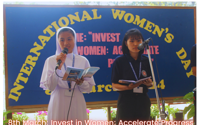
8th March: Invest in Women: Accelerate Progress