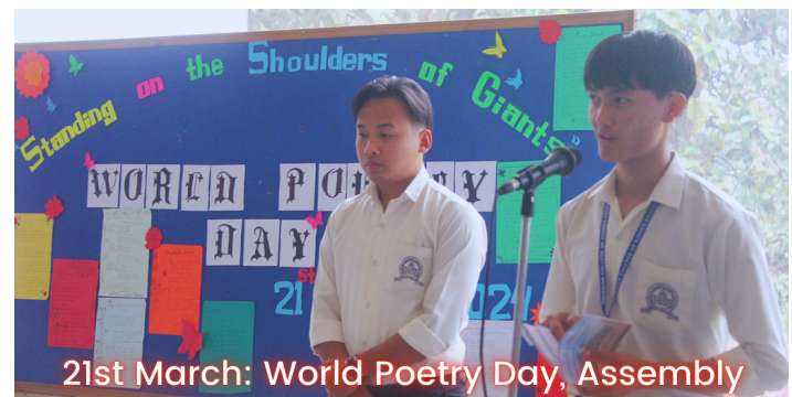
21st March: World Poetry Day, Assembly

Dimapur, Nagaland, India VPMG+98F, Kuda Village, Half Nagarjan, Dimapur, Nagaland 797112, India Lat 25.883542° Long 93.72651° 14/03/24 10:36 AM GMT +05:30