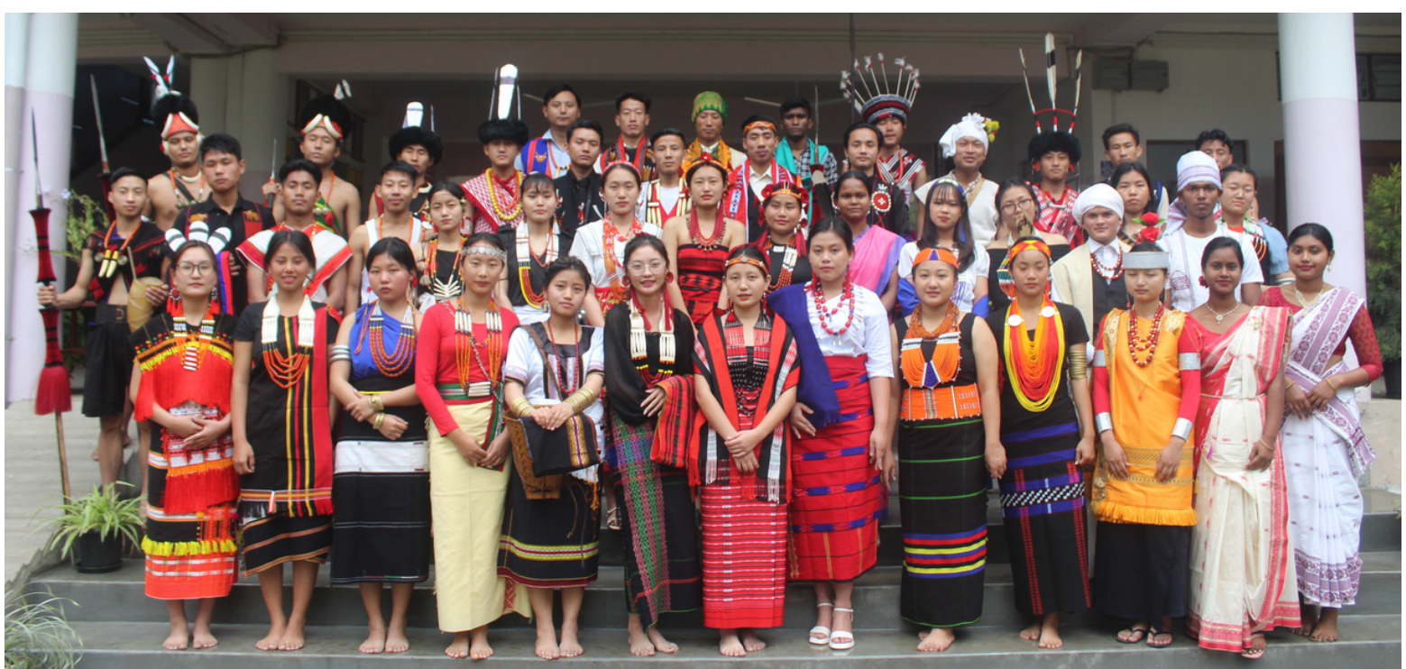
SCHE Students in Traditional Attire