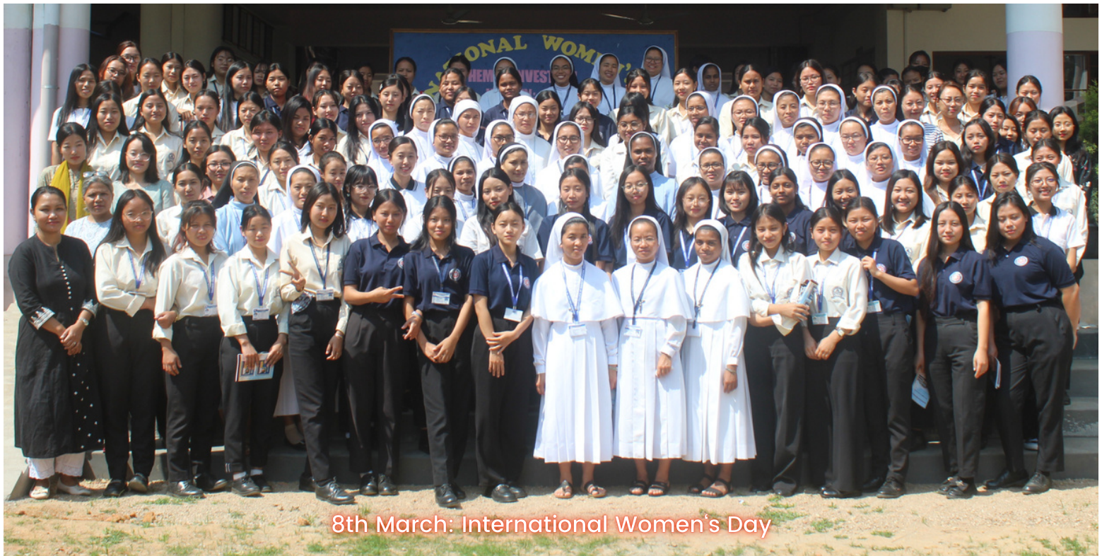
8th March: International Women's Day